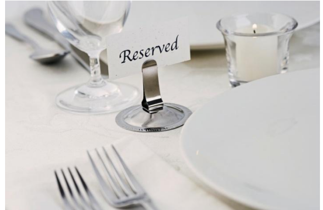
Table Setting Guidelines

~ American System of Judging ~ (Unless otherwise stated)